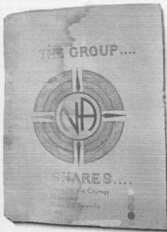
This is the original NA logo drawn by Jimmy K. The circles around the logo are in colors corresponding to the key below. The inside of the "A" is left uncolored except for a dot representing God. The rest of the inner circle is yellow, representing strength and courage. The next ring is green, representing friendship. Next is blue, representing peace and serenity. The outer ring is red, representing love.

In Steve's final report, he described a growing awareness of just how important Jimmy K was, not only to NA of the 1950s and 1960s, but even today. Jimmy's ideas and vision for NA as a worldwide fellowship were clearly reflected in the archival material. For example, Jimmy's original drawing of the stylized NA logo with the circles and four lines projecting from the outer circle, and what eventually happened to those lines, shows how some of his original ideas were misinterpreted years later. When looking at the cardboard poster of the original NA logo, it is clear that the four lines were directional markers depicting the dream of NA spreading in all four directions. However, a later interpretation viewed the four lines as having Christian symbolism,