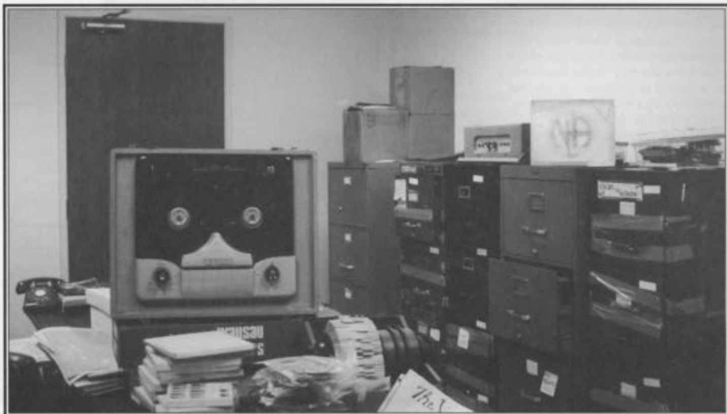
The archives, complete with duct tape and dial phone.

First contacts with newly formed NA communities aren't always recognizable as being from NA communities. Often, a mental health professional or