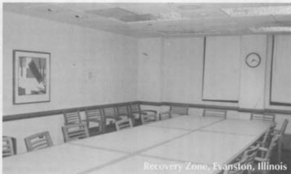
Recovery Zone, Evanston, Illinois

Ever been away from your home area and visited an NA meeting? The posters on the wall, the place where the coffeepot sits, the tables, the chairs, the literature—it all adds up to an atmosphere of recovery. And you thought NA meetings were only held in church basements!