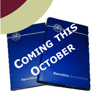
Sixth Edition Basic Text

The new edition of the Basic Text in hardcover and softcover is scheduled to be available 1 October 2008, at which time we will remove all versions of the Fifth Edition stock we still have in the inventory. Large-print, line-numbered, and CD-ROM versions will also be published soon.